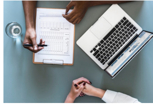
Healthcare Employee Series: Should I Contribute to My 457(b) Plan?