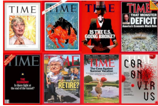
Time After Time: Stock Market Crashes and The Media